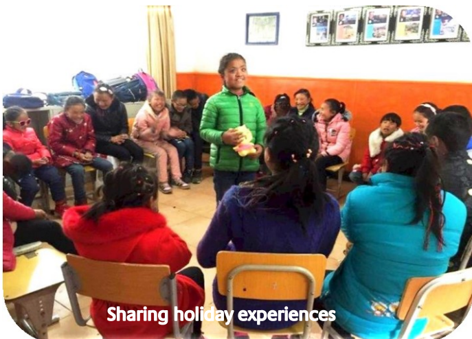
Sharing holiday experiences