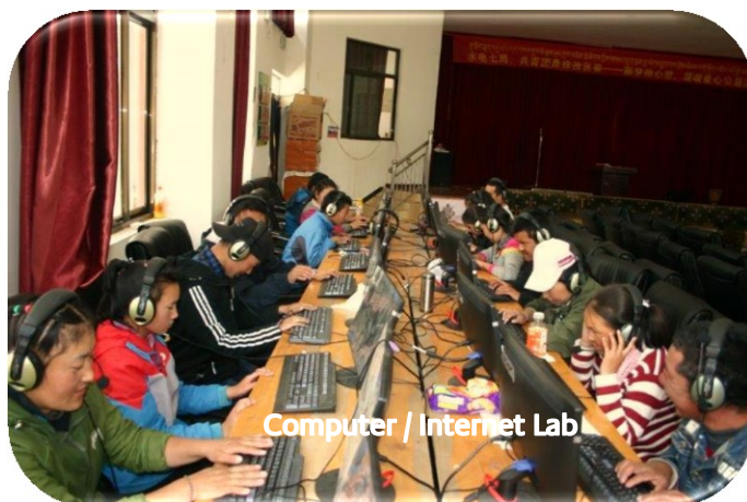
Computer / Internet Lab