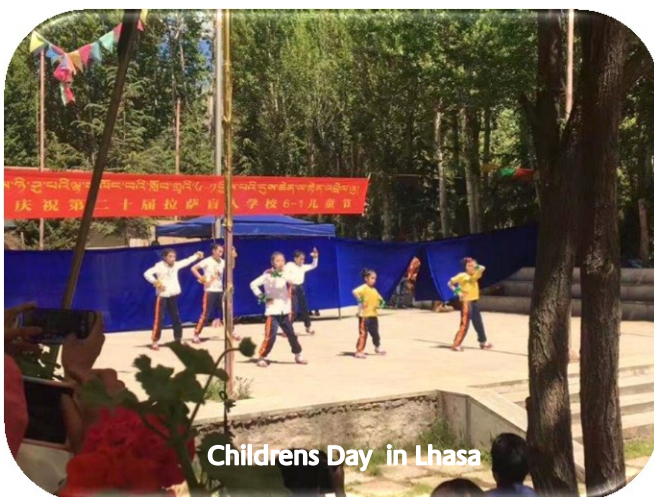
Childrens Day in Lhasa