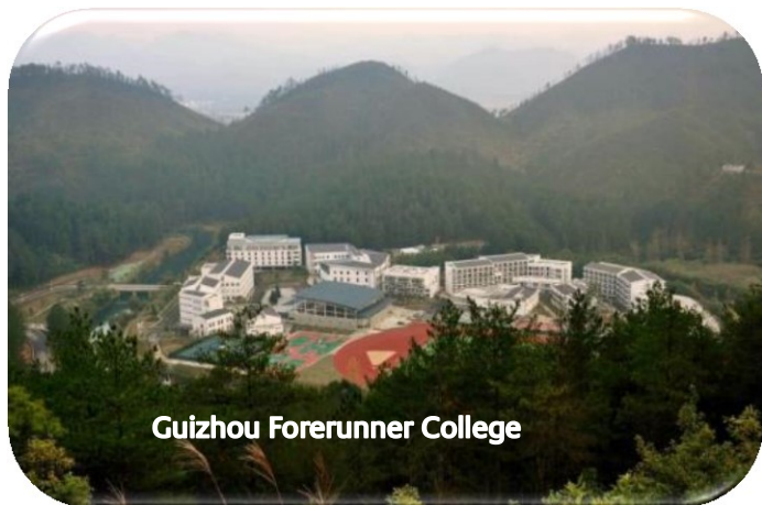
Guizhou Forerunner College