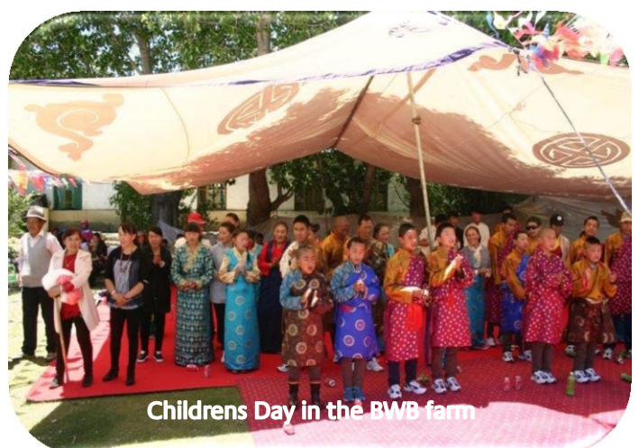
Childrens Day in the BWB farm